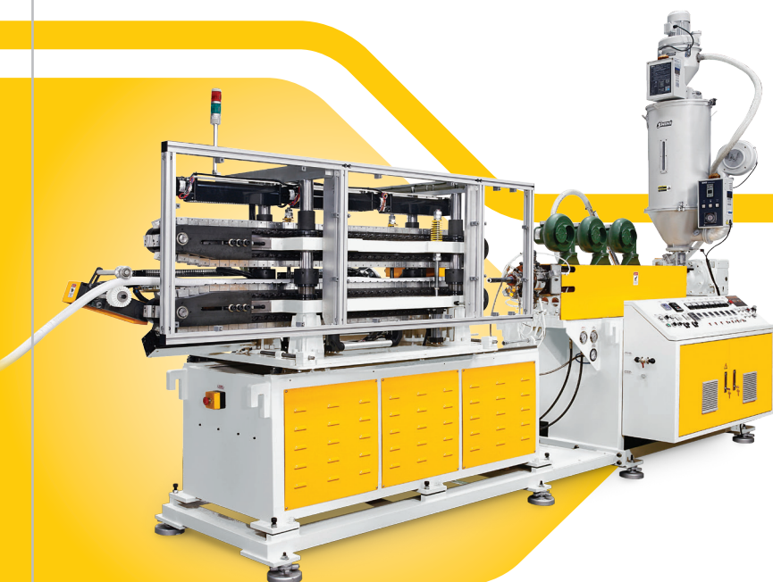
BREATHING CATHETER EXTRUSION LINE